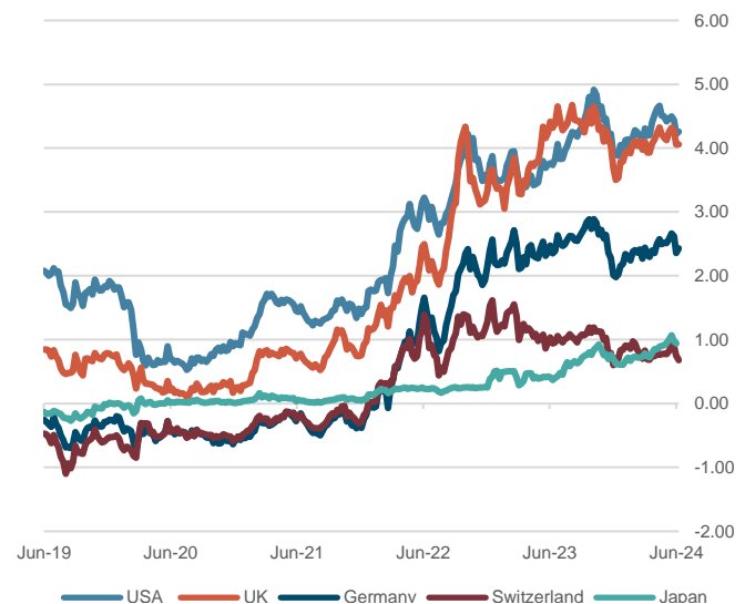
10 year government bond yields in %, last 5 years

The inflation shock of the last four years has also been misjudged in terms of determinants. Many attributed it to the expansionary monetary policy of the past decade. It is therefore demand-related. However, the research results of the last two years show that the shortage of supply was a much more important determinant. Goods became scarce due to the pandemic and the war. The price explosion helped to quickly overcome this shortage. Not surprisingly, most prices have fallen back to their starting levels with the normalization of supply. This has not little to do with monetary policy.